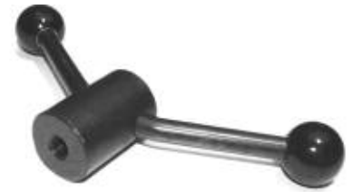
Double Straight Design