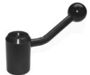
Single Offset Design