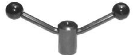
Double Offset Design